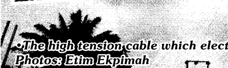
The high tension cable which electrocuted Effiom. Inset: The gutter he was working on.