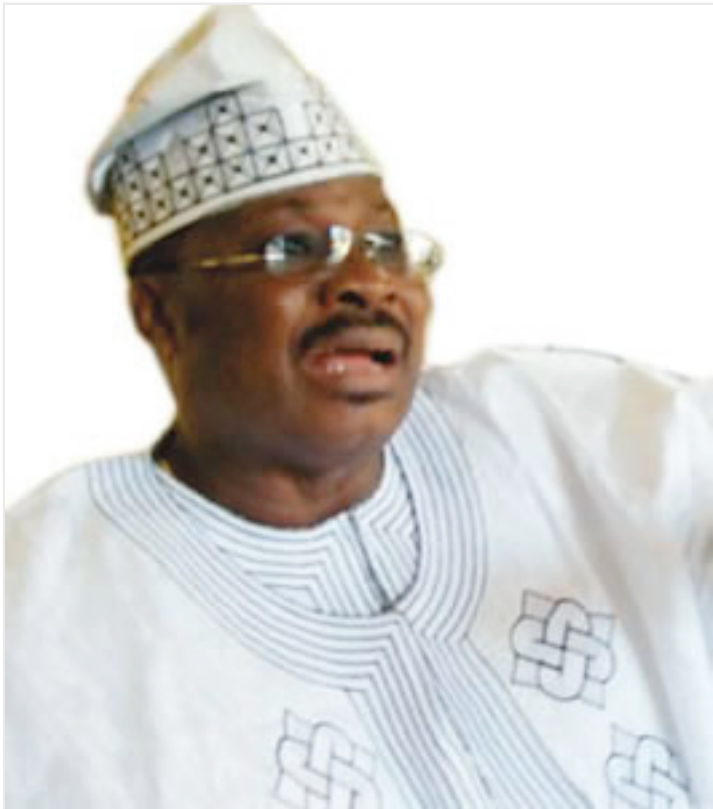
Oyo State Governor, Abiola Ajimobi

local dam in the area overflow, sending water crashing through the informal settlements surrounding the river banks.