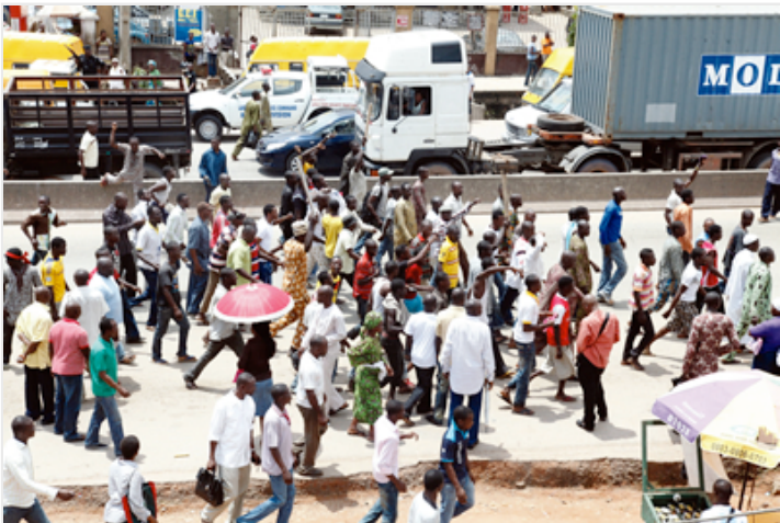
Protesters on the Lagos-Abeokuta Expressway...on Monday

The invasion by the hoodlums, our correspondents gathered, was precipitated by a meeting of members of the NURTW in the area, who vowed to resist Alfa.