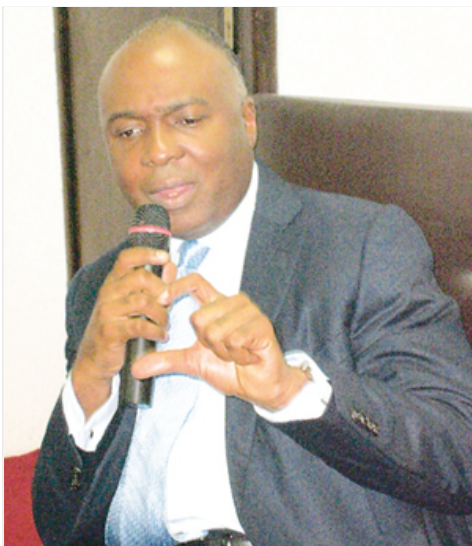
Dr. Bukola Saraki

View All (34) Comment(s) Post Comment Twitter Send to friend Share