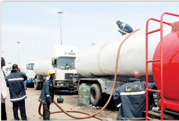
Firefighters assessing the scene