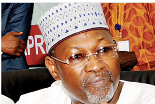
Chairman of INEC, Prof. Attahiru Jega

View All (132) Comment(s) Post Comment Twitter Send to friend Share