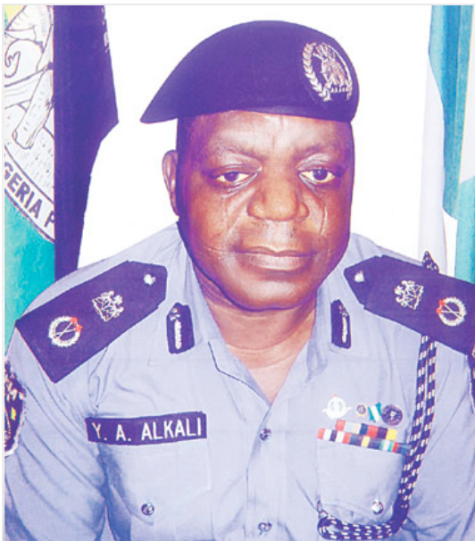
Lagos CP, Yakubu Al-Kali

View All (31) Comment(s) Post Comment Twitter Send to friend Share