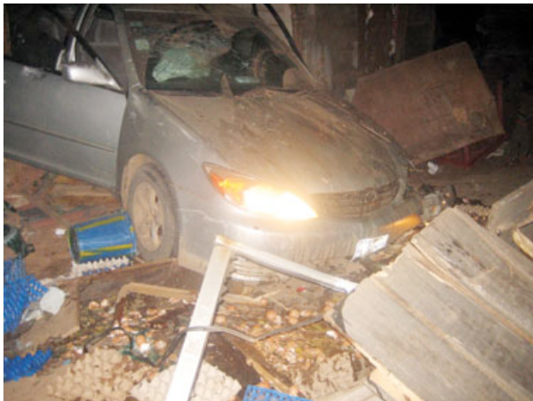
One dies, others flee as bandits engage police in shootout

View All (1) Comment(s) Post Comment Twitter Send to friend Share