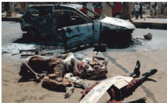
Scene of recent bomb blast in Jos on Christmas eve, 2010.

View All (87) Comment(s) Post Comment Twitter Send to friend Share