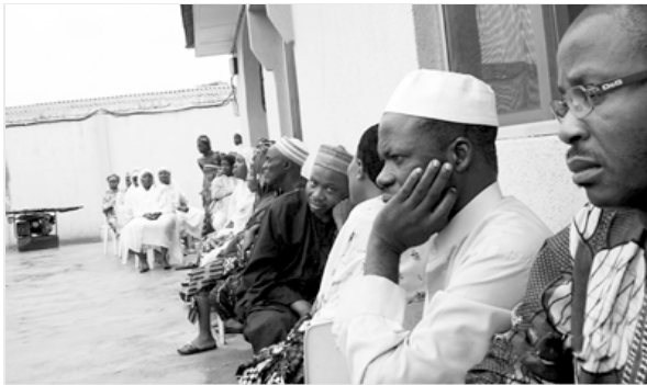
Sympathisers at Adeagbo residence on Sunday

View All (72) Comment(s) Print Post Comment Facebook Twitter Send to friend