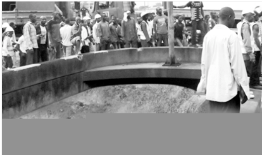
Find the killer of my father, son tells police

View All (54) Comment(s) Print Post Comment Facebook Twitter Send to friend