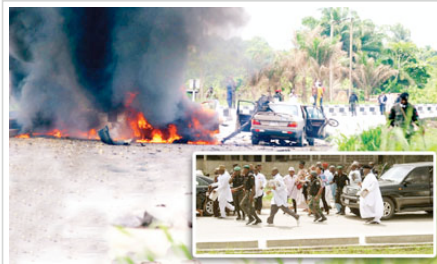
Scene of the bomb blasts in Warri, Delta State... on Monday.

But three people were unlucky as they were burnt to death in an inferno caused by explosions which occurred within 15 minutes from cars parked on the NPA Expressway where the DSGH annex is situated. Six others who were injured were rushed to the clinic of a major oil company in Warri for treatment.