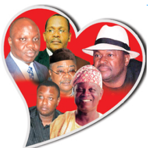
Colour of Valentine for Nigeria's elite