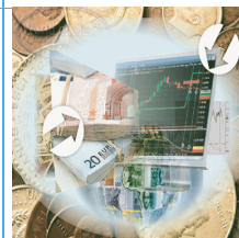
Forex: Analysts fear CBN clampdown may deter investments