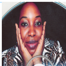
Waiting for Shallee