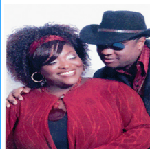
Where to hang out this Valentine