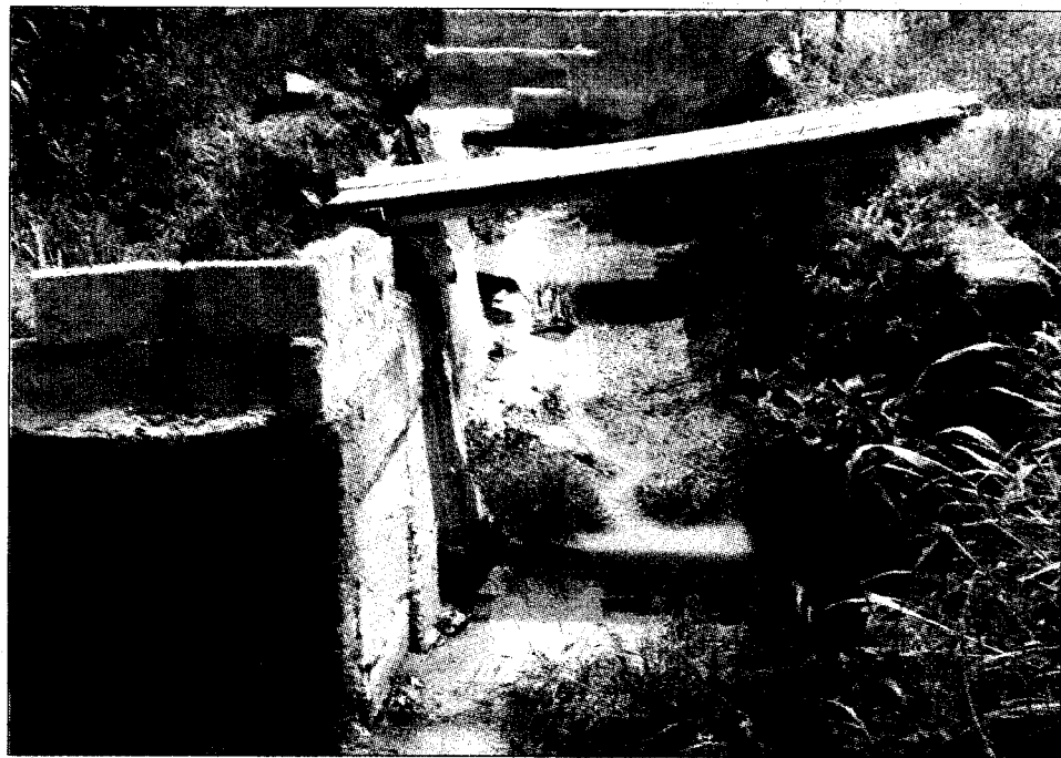
•The erosion route

Erosion has conquered the Baba Egbe area of Agbelekale in the Agbado Oke Odo Local Council Development Area of Lagos State and constantly threatens it with dangerous floods. The flood claimed its first victim late last month. Unfortunately, it was the only daughter of a woman, whose husband also seems to have deserted her, writes EMMANUEL ONYECHE