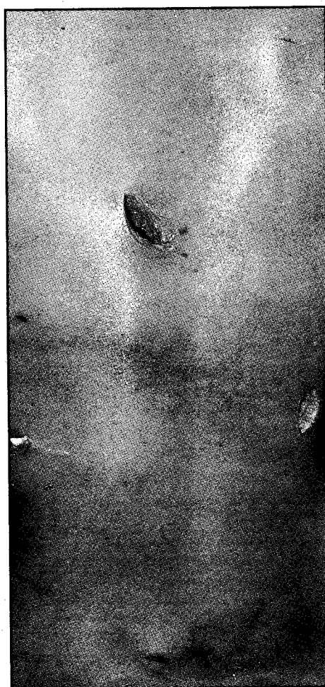
•Daba, the victim

knowledge of what could be the motive behind the attack on Daba, but said it was not uncommon for cult members to attack non-cult members on campus over the struggle or contest for female students.