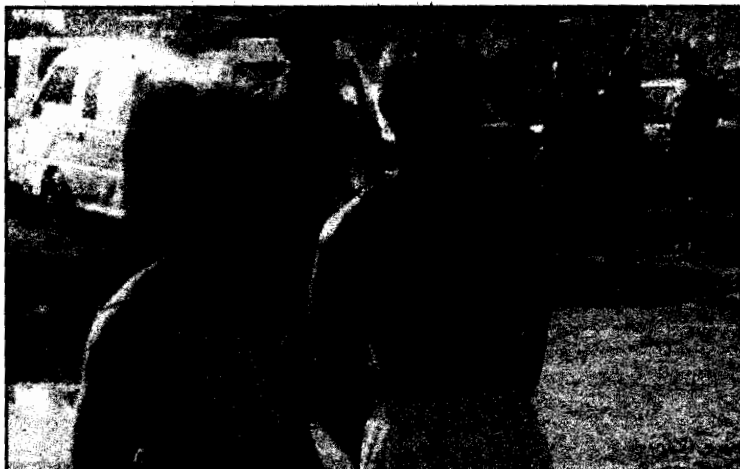
Suspects arrested in attempt to put tinted glasses on their Mitsubishi

The people of Aba are noted for taking the bull by the horn when the