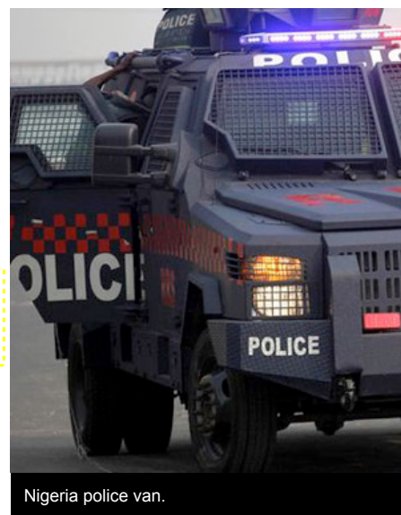
Nigeria police van.

this is a sheer ignorance and misconception of islam: as you also acknowledged, that islam "is a