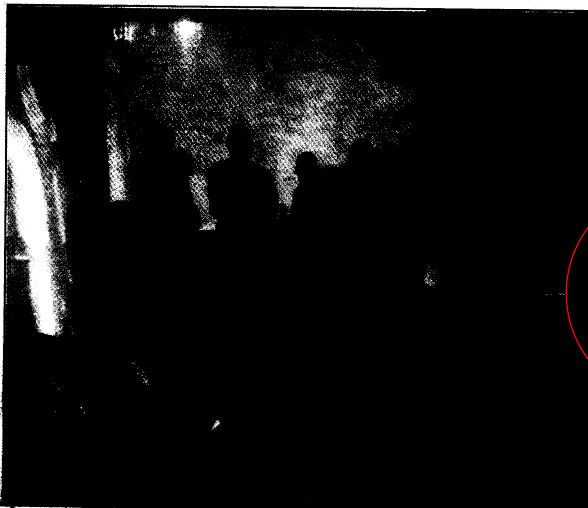
• Suspected pirates in detention

"Their informants regularly feed them with information needed to guide their movement. These informants have been responsible for the low success recorded in the past. The syndicate must have got wind of counteractive action plan even before we set out. This is the