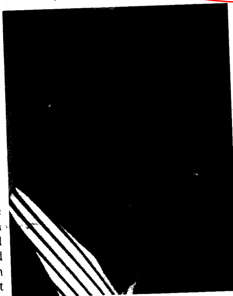
•Gbagi: Wants state of emergency in Delta State over rampant kidnapping

But the governor did not agree with Gbagi's position. Inaugurating the anti-kidnapping squad, Uduaghan described abductors