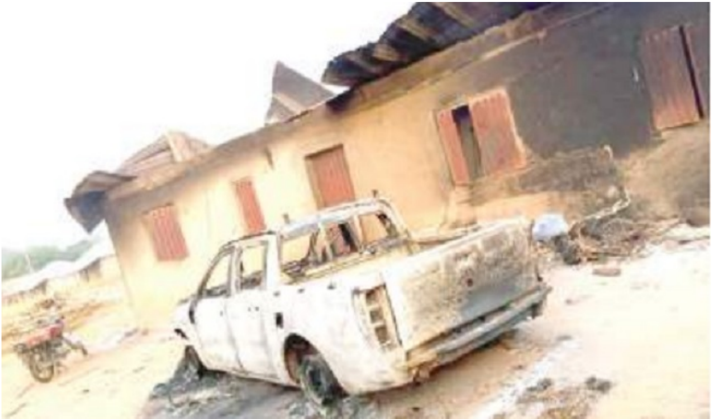
A residential building and a vehicle burnt down during invasion by suspected bandits/terrorists in Galkogo Town in Shiroro Local Government Area of Niger State on Saturday.