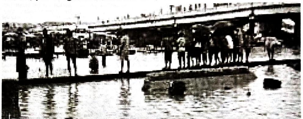
Stranded residents during the downpour at Mile2 area of Lagos State on Saturday.

Meanwhile, hundreds of motorists and passengers going to Mile 2 were stranded as a result of the flood which disrupted free movement on the trade fair and Abule-Ado axis of Lagos-Badagry Ex-