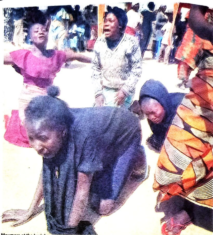
Mourners at the burial programme