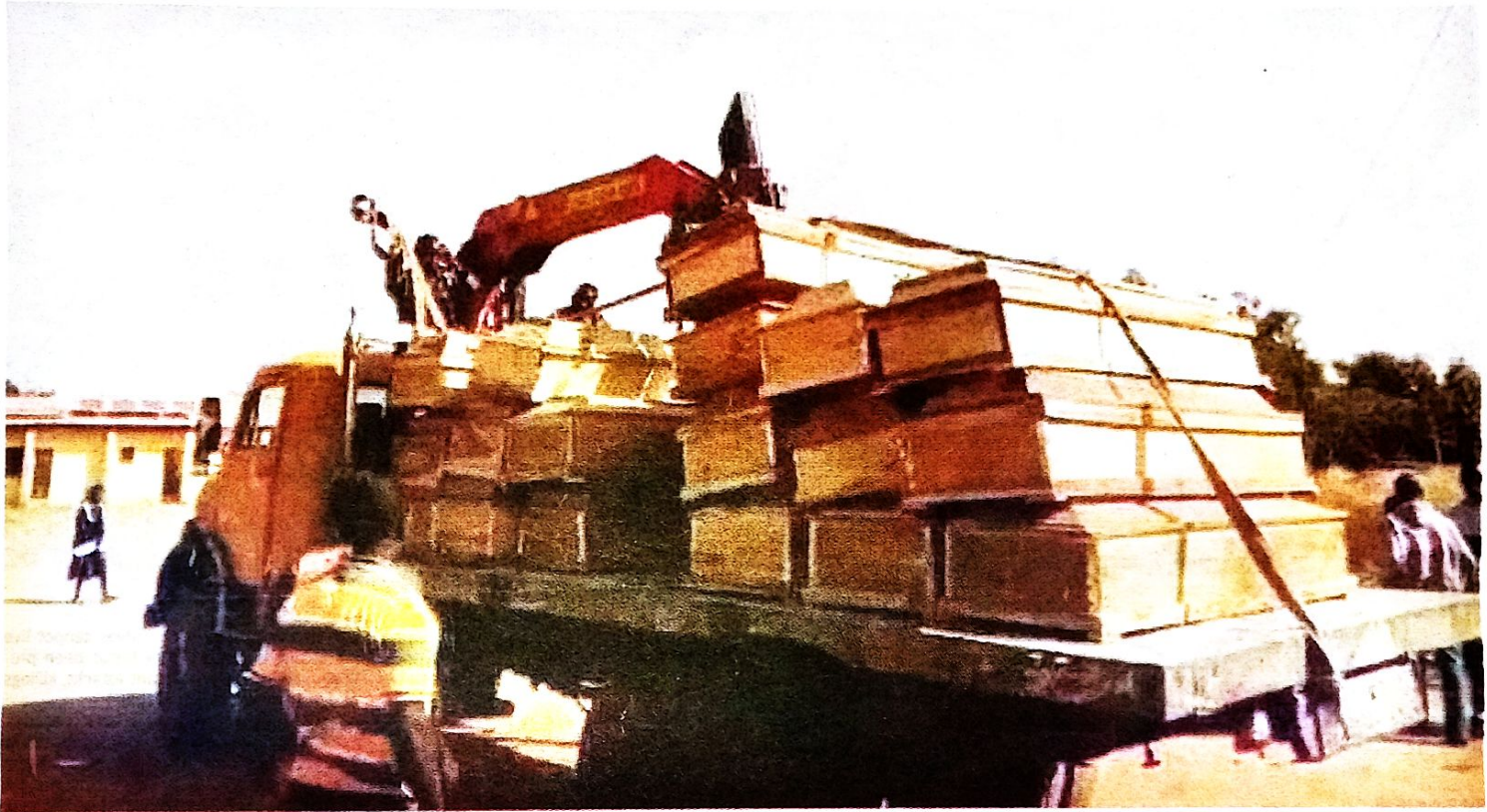
Caskets being conveyed to the burial site

The reported killings of over 38 people in separate attacks on Malagum 1 and Sokwong villages in Kaura Local Government of Kaduna State, have thrown the state into yet another round of mourning. MUHAMMAD SABIU, in this piece, reports the general mood of the state as the terror victims are given a mass burial