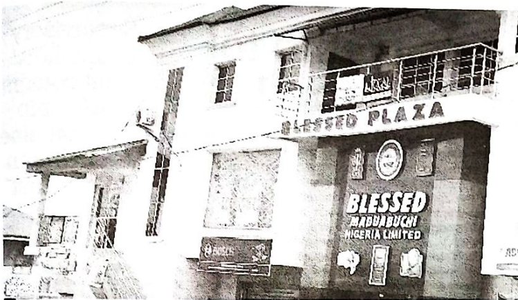
His complex at Ogunpa