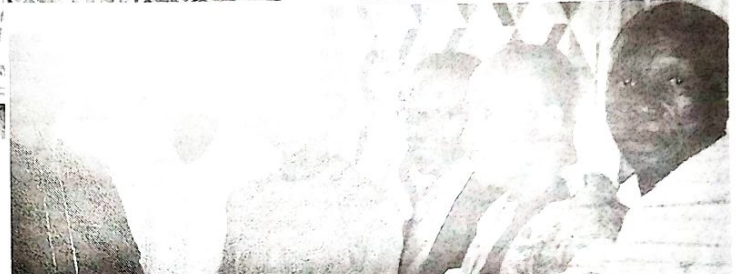
Some of the members of Imo Town Development Association, Oyo State chapter.