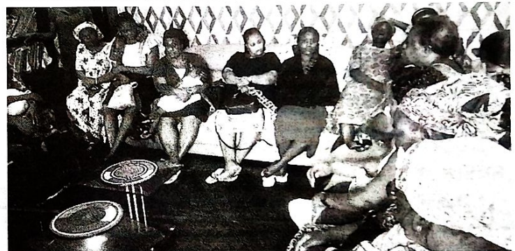
Sympathisers with the widow

crying that would not come out smiling. He used to help a lot of people and we all loved him. His murder is shocking and we are all in pain."