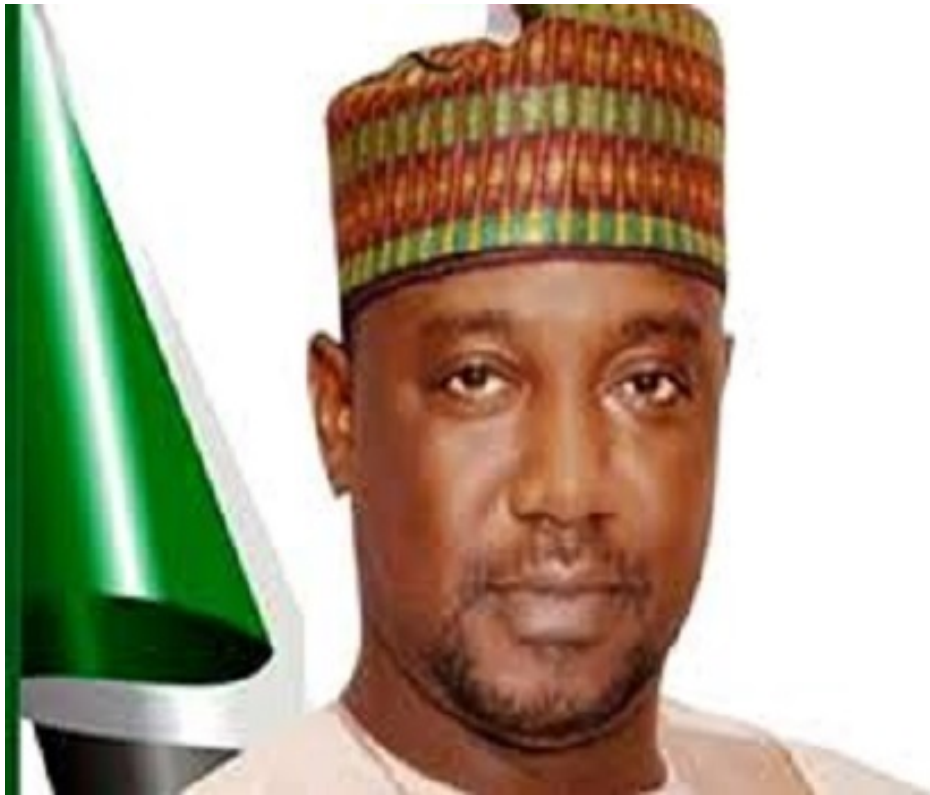
Governor Abubakar Bello of Niger State