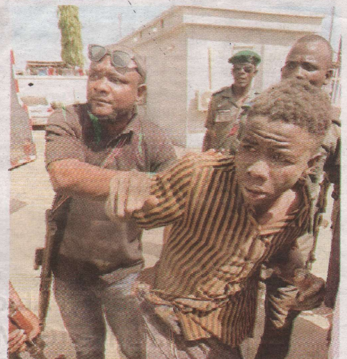
Another suspect arrested by the police.

Two men in police net for duping bank manager $200,000 in Adamawa