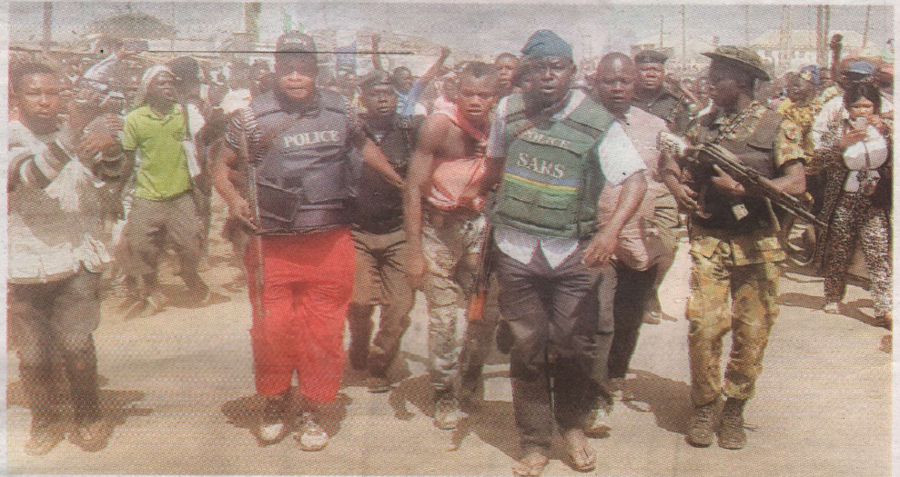
One of the robbery suspects being led by policemen after his arrest, on Saturday.

"The immediate response by the police and military is very commendable and we truly appreciate them for their doggedness and commitment," she said.