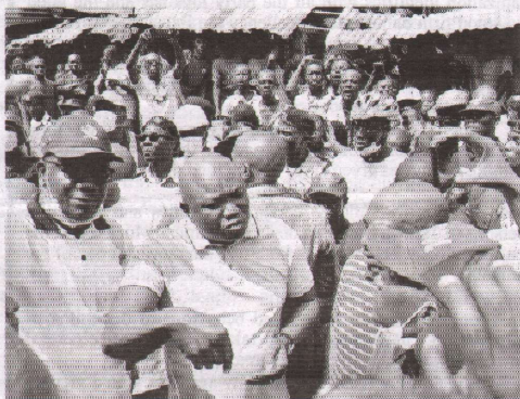
Lagos State governor, Akinwunmi Ambode at the scene

By Olalekan Olabulo, Tunde Alao, Leon Usigbe