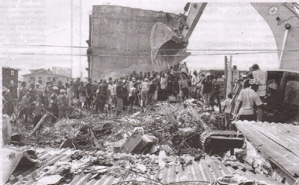
an excavator working through rubbles in search of survivors.

in front of its present location, but the school proprietress relocated them to the collapsed building."