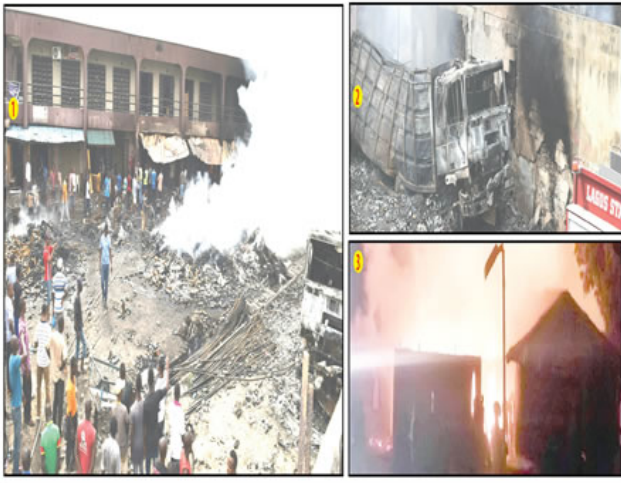
Scenes of fire incidents that ravaged some shops at the International Trade Fair Centre, on Lagos-Badagry expressway (Photos 1 & 2) and Abuja Arts and Craft Village (Photo 3) in the early hours of Saturday.