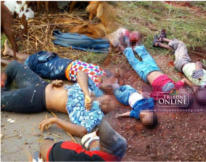
19 die in Edo road accident on Thursday 31st August

It was a black Friday in the ancient town of Ijebu-Igbo, in Ijebu North Local Government Area of Ogun State, as a timber lorry rammed into worshippers at the Atikori Praying Ground for the Eid-el-Kabir festival, leaving two dead and several other worshippers injured.