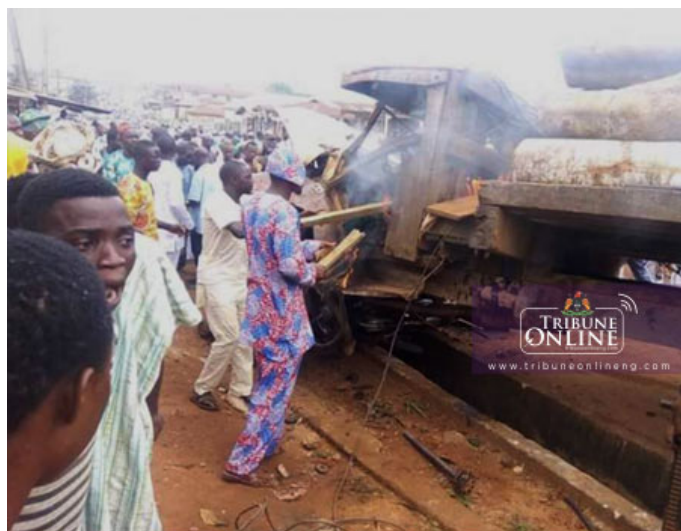
Angry mob destroying the ill-fated timber lorry that plow into a praying ground at Atikori in Ijebu-Igbo, on Friday.