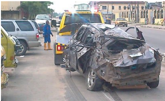
The car involved in a lone accident on Iddo Bridge being towed on Sunday.

🕒 October 10, 2016 👤 Olalekan Olabulo - Lagos 📁 Metro