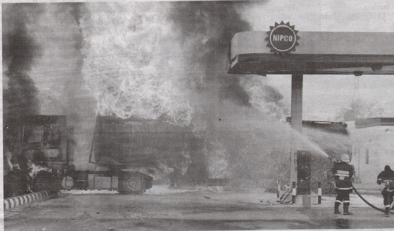
Fire fighters putting out fire as petrol tanker exploded at NIPCO Filling Station, Airport Road, Abuja, on Thursday.