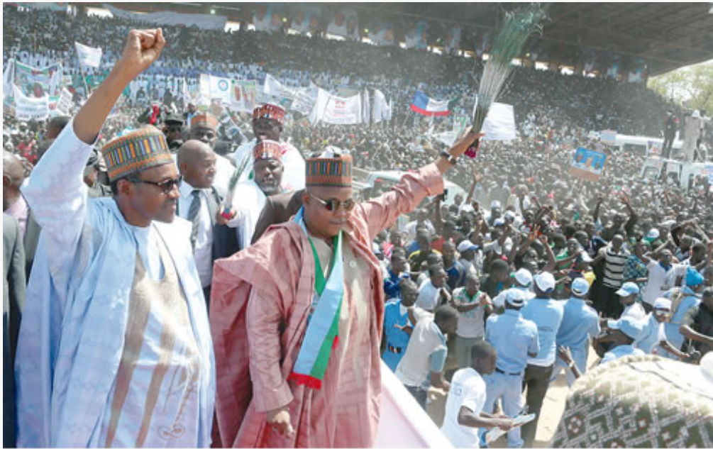
All Progressives Congress (APC) presidential candidate, Major-General Muhammadu Buhari (left), with the Borno State governor, Alhaji Kashim Shettima, acknowledging cheers from the crowd at the Ramat Square, Maiduguri, venue of the campaign rally, on Monday.