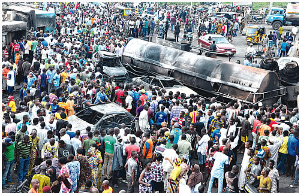
The spot where the tanker fell and exploded at Molete roundabout, Ibadan.