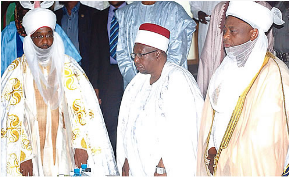
From left, the Emir of Kano, Alhaji Mohammed Sanusi; the Shehu of Borno, Alhaji Abubakar Garbai Ibn-El-Kanemi and the Sultan of Sokoto, Alhaji Sa'ad Abubakar, at the meeting in Kaduna, on Wednesday.

PANDEMONIUM broke out at the Federal College of Education (FCE), Kano, when two suicide bombers invaded the premises of the school, killing 15 people, including themselves.