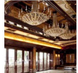
What Happens When You Have Money and No Taste