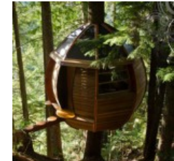
7 Hotels That Will Blow Your Mind