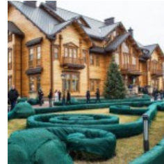
This Mansion Is a Unique Combination of Luxury and Bad Taste