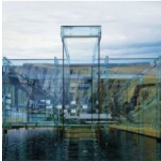
A House with Glass Instead of Walls

23 Years Local After-Sale Service! 150-1000t/h, Exporting 130 Country