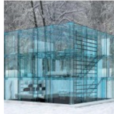
A Fairytale Transparent House in Real Life