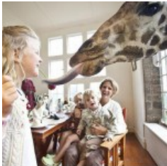
Crazy Hotels around the World