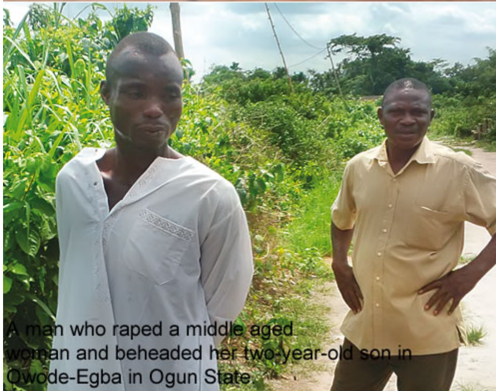
A man who raped a middle aged woman and beheaded her two-year-old son in Owode-Egba in Ogun State

Also, a pastor was arrested in Olorunsogo area of Abeokuta for raping a girl of school age. The 34-year-old man claimed to be "testing" the virginity of his victim. As if that was not enough, the police also arrested five persons who were in possession of human skull and parts of human flesh at Joju area in Sango-Ota area of the state.