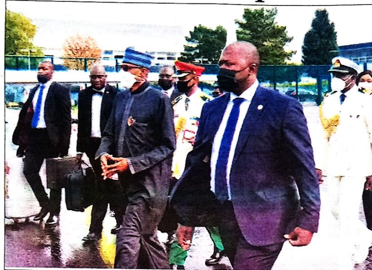
• President Muhammadu Buhari (3rd left) departing Le Bourget Airport in Paris, France for Durban, South Africa yesterday.

He said: "Troops of Joint Task Force, North East Operation HADINKAI have neutralized several Islamic State West Africa Province (ISWAP) ter-