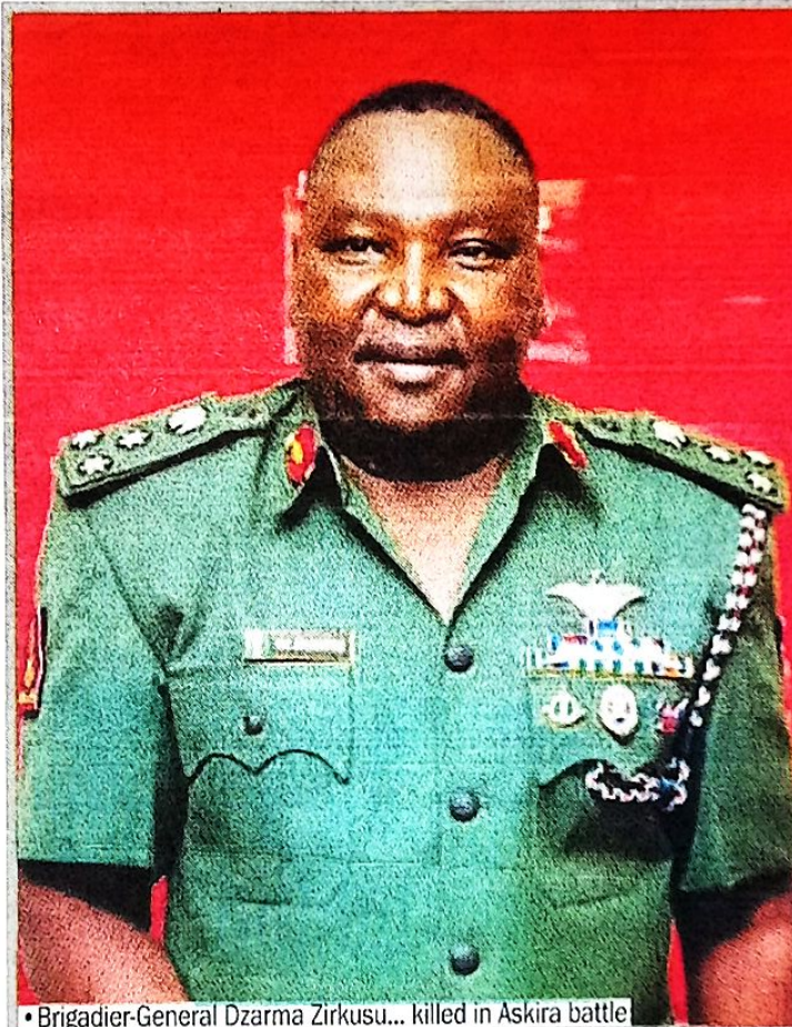
• Brigadier-General Dzarma Zirkusu... killed in Askira battle