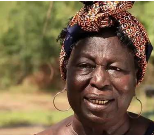
93-Year-Old Nigerian: I Never Ill Because I Clean My Vess