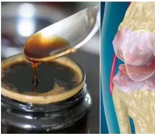
If You Have Joint Pain, Rea Before It Gets Deleted!