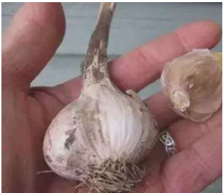
Try It Tonight - Pain In You Will Vanish Once And For A