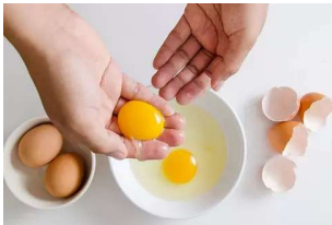
Stable Blood Pressure Till Old Age. Take 2 Minutes To Read