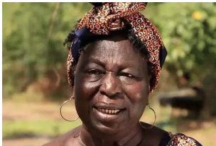
93-Year-Old Nigerian: I Never Get Ill Because I Clean My Vessels