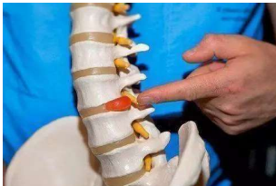
Everyone Who Suffers From Back Pain Read This