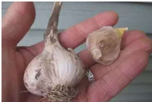
Try It Tonight - Pain In Your Joints Will Vanish Once And For All