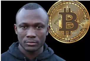
Benin City Millionaire: Get Rich With Bitcoin, Without Buying Bitcoin