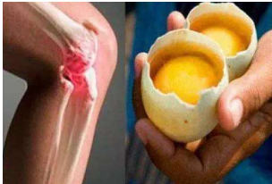
If You Have Joint Pain, Read It Before It Gets Deleted!