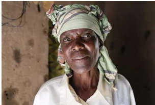
113-Year-Old Nigerian: My Husband And I Clean Our Vessels