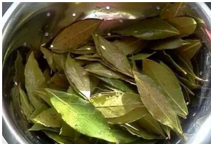
Three Signs That A Stroke Is Near And There Are Heart Problems