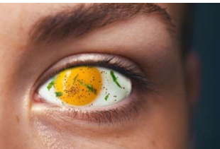
You Can Restore Your Visio Within A Week If You Eat 1 Food!