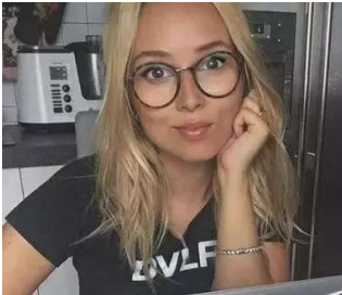
It All Happened So Fast For Mom Who Got Rich With B You Don't Need To Buy Bite Make Money With Crypto