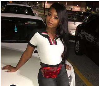
She Was An Ordinary Girl I Lagos. Now She Makes $9,5 Week