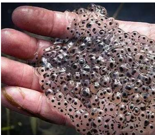
Just A Couple Of These Cap Restore 100% Vision In 2 W