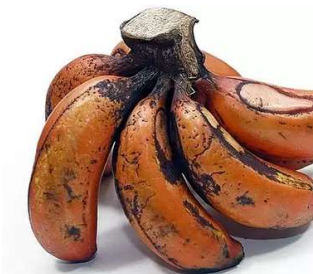
Stable Blood Pressure Till O Take 2 Minutes To Read