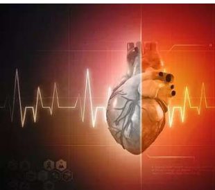
How To Avoid A Heart Atta This 3 Times A Day)