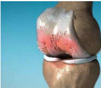
Those With Pain In The Joint The Knees And Hips, Read