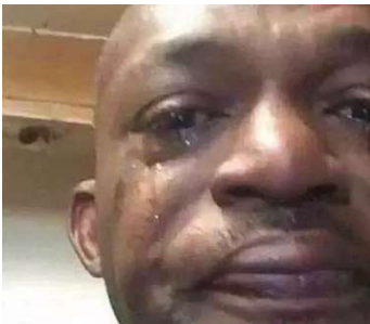
A Man From Lagos Makes $ A Day Using This Trick