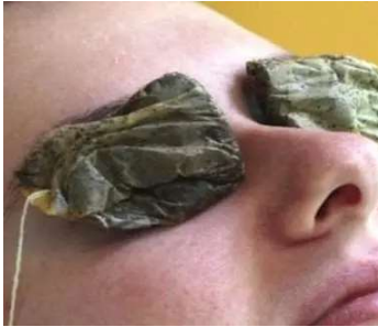
How To Restore 100% Sight Without Surgery?