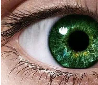
Just Two Drops Of This Pro Are Sure To Restore 100% V