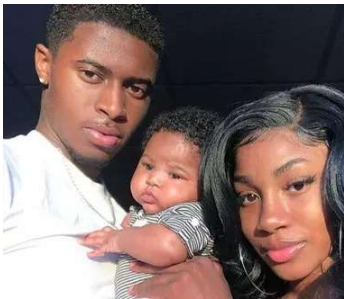
A Family From Lagos Make Money With Bitcoin Without Buying It