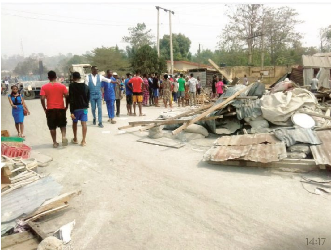
•Onlookers at the scene of the accident