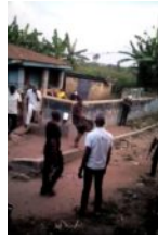
Police stormed the ritualist den.