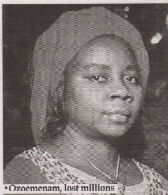
• Ozoemenam, lost millions

WEDNESDAY was a sad day for most traders in Ochanja, the commercial district of Onitsha, Anambra State. A tanker fire that occurred at Upper Iweka and spread to the popular Ochanja Market close by claimed many lives and destroyed no fewer than 500 shops.