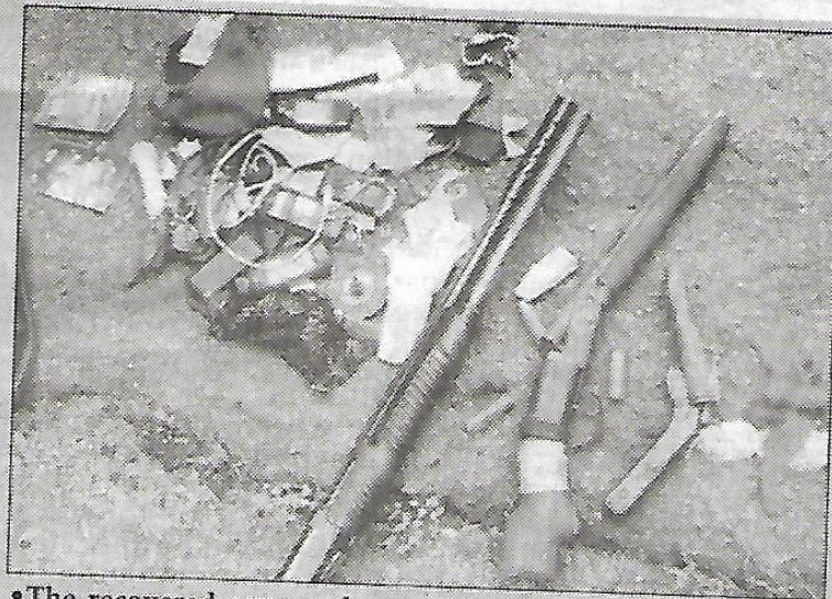
•The recovered arms and ammunition

T WO of the four suspected kidnappers arrested in Ogun State and one of their 'colleagues' have been killed.