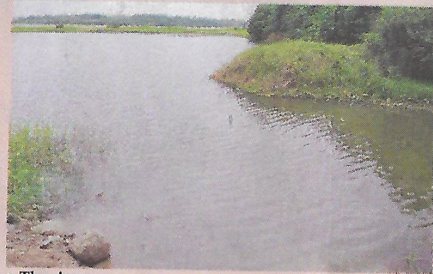
• The river

It was learnt that the pupils had ignored a message on a signpost placed near the river warning people not to swim in the river.