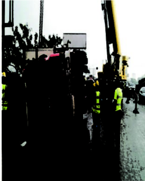
•The accident scene at Kara... yesterday