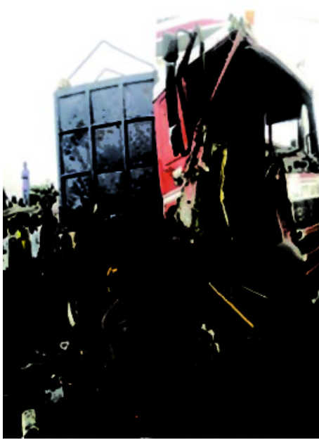
•The truck hit by train... yesterday