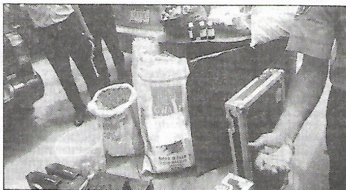
•Some Items recovered from the suspects by the police

"Eight suspected cultists were arrested. A robbery suspect died in the course of battle with police. 18 guns were