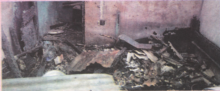
•The burnt apartment... yesterday

A GONY struck at Ejigbo, a Lagos suburb after a pastor's mistress allegedly set his family's apartment on fire.