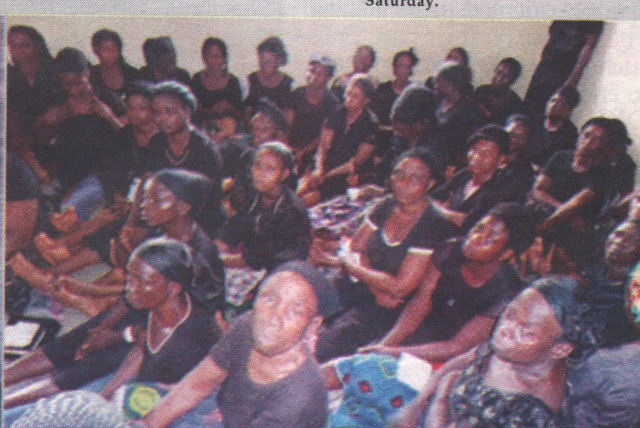
• Yeghe women during their prayer session.