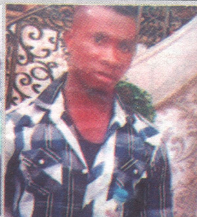
• The late Saturday.